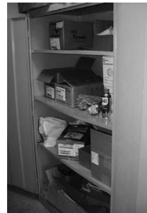
. . . and personal protective equipment stays out