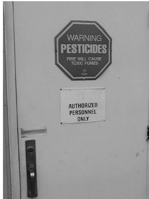
Entry ways to storage area should be posted and locked

Secure entry points (including windows) against unauthorized access to prevent theft, injury, and product damage. Post each access with signs that clearly indicate that you store pesticides in the building. Although a facility may have several access points (e.g., to allow for emergency exits), limit daily use to as few as possible. This will make it easier to monitor building access and thus reduce the potential for unauthorized entry.