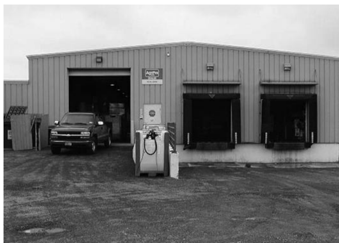
Storage area with separate access from retail space