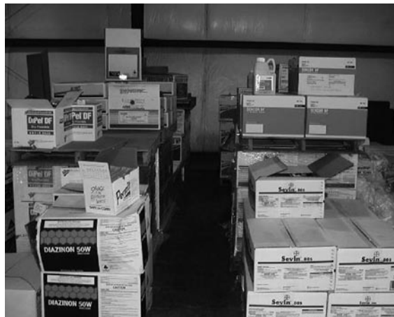
Pesticides go in a pesticide storage area. . . .